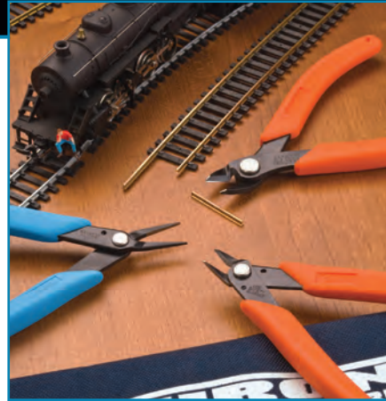
Model Railroader's Toolkit #TK 2200

Featuring our professional series tools - designed by a modeler for modelers: #2175ET Professional Sprue Cutter, #9180ET Professional Photo-Etch Scissor as well as our #450 TweezerNose™ Plier.