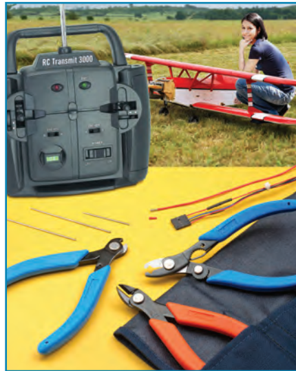
Model Aviation RC Toolkit #TK 3300

Three timeless tools for any model railroader; our #2175B Track Cutter, #410T Original Sprue Cutter and #450S TweezerNose™ Plier (serrated).