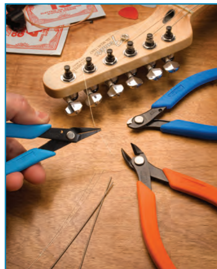
Musician's Toolkit #TK 3400

You asked and we listened. This toolkit features the tools most in demand by those who work with photo-etch accessories: #9180ET Professional Photo-Etch Scissor, #575 Micro-Bending Plier, and #450 TweezerNose™ Plier.