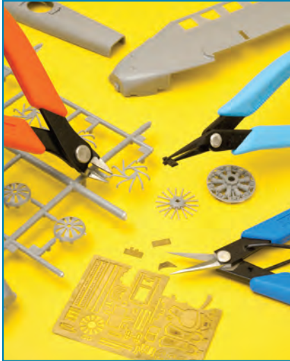
Professional Modeler's Toolkit #TK 3200

Custom designed tool kits for a variety of hobbyists. Each kit contains three tools that are packaged in a protective canvas tri-fold pouch to keep them safe and organized. Additional kits are available and can be viewed on our website.