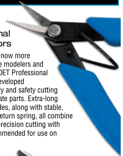
Photo Etch accessories are now more popular than ever with scale modelers and model railroaders. Our 9180ET Professional Photo-Etch Scissors was developed specifically for easily, cleanly and safely cutting without damaging the delicate parts. Extra-long and ultra-sharp scissor blades, along with stable, curved handle grips and a return spring, all combine to create a tool that offers precision cutting with stability and control. Recommended for use on photo-etch parts only.